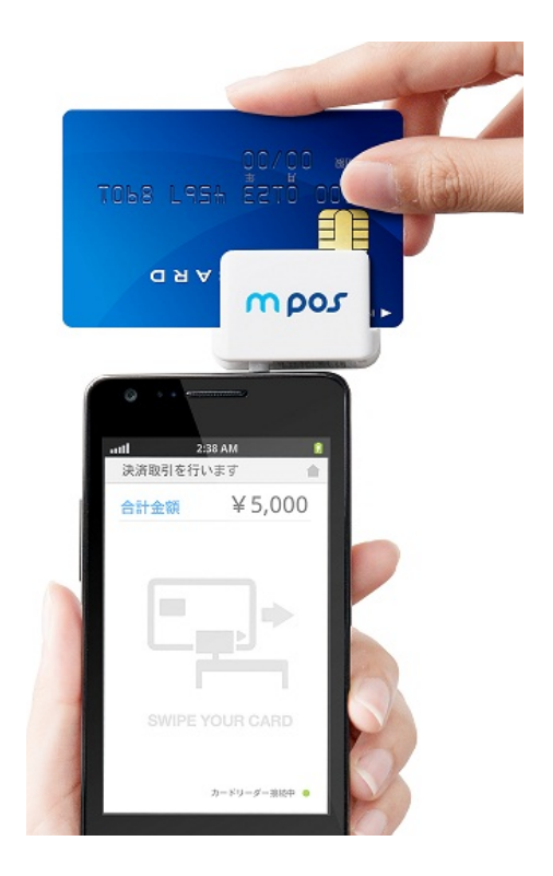
Payment screen with card reader