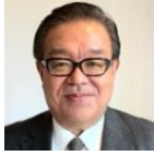
Jun Murai Senior Advanced Research Project Professor, Keio University

Jun Murai received his Ph.D. in Computer Science from Keio University in 1987, with a Focus on the Internet and computer communications. He established JUNET in 1984, the first network in Japan to connect multiple universities. In 1988, he founded the WIDE Project, a Japanese research consortium focused on the Internet. He has long been engaged in research on Internet technology platforms and is widely known as the “Father of the Internet in Japan,” and internationally as the “Internet Samurai.” He serves as Special Advisor to the Japanese Cabinet and Advisor to the Digital Agency, and he is involved in various governmental committees and international scientific associations. His honors include the 2011 IEEE Internet Award, the 2013 Internet Hall of Fame (Pioneer), and the 2019 Knight of the Legion of Honor from the French Government.